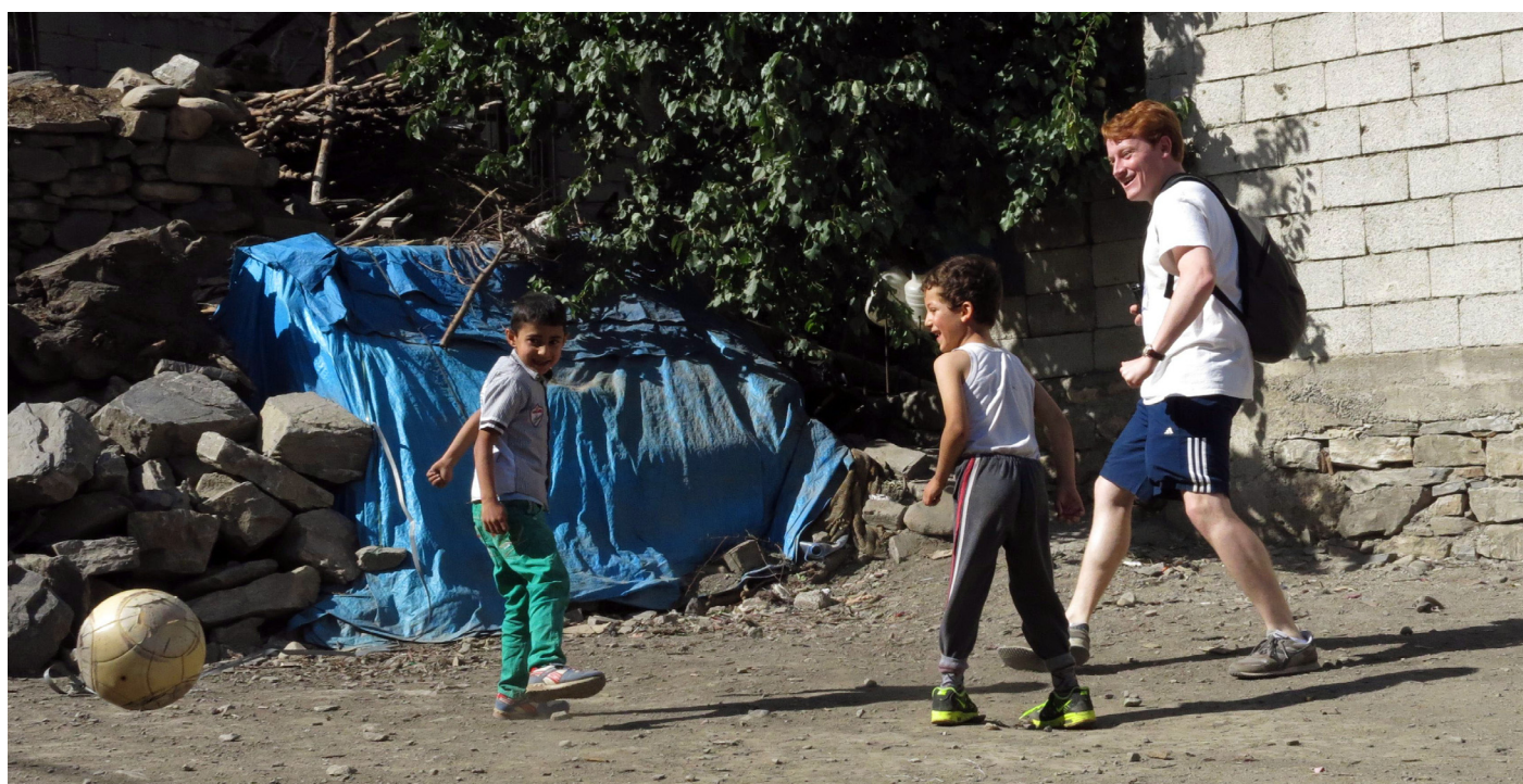
Top to bottom: border between Turkey and Armenia; playing football in Çatak, south of Van