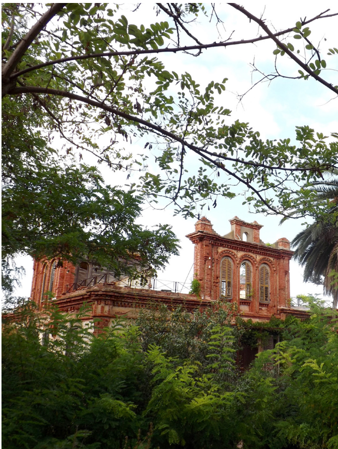
Trotsky's Mansion, Büyükdada,