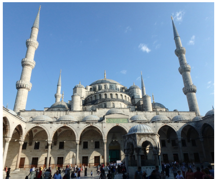
Sultan Ahmet Mosque