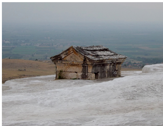
Top to bottom: Mt Nemrut; Pamukkale/Hierapolis.